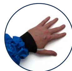
Double cuff with thumb loop

Specifications, configurations and colors are subject to change without notice.